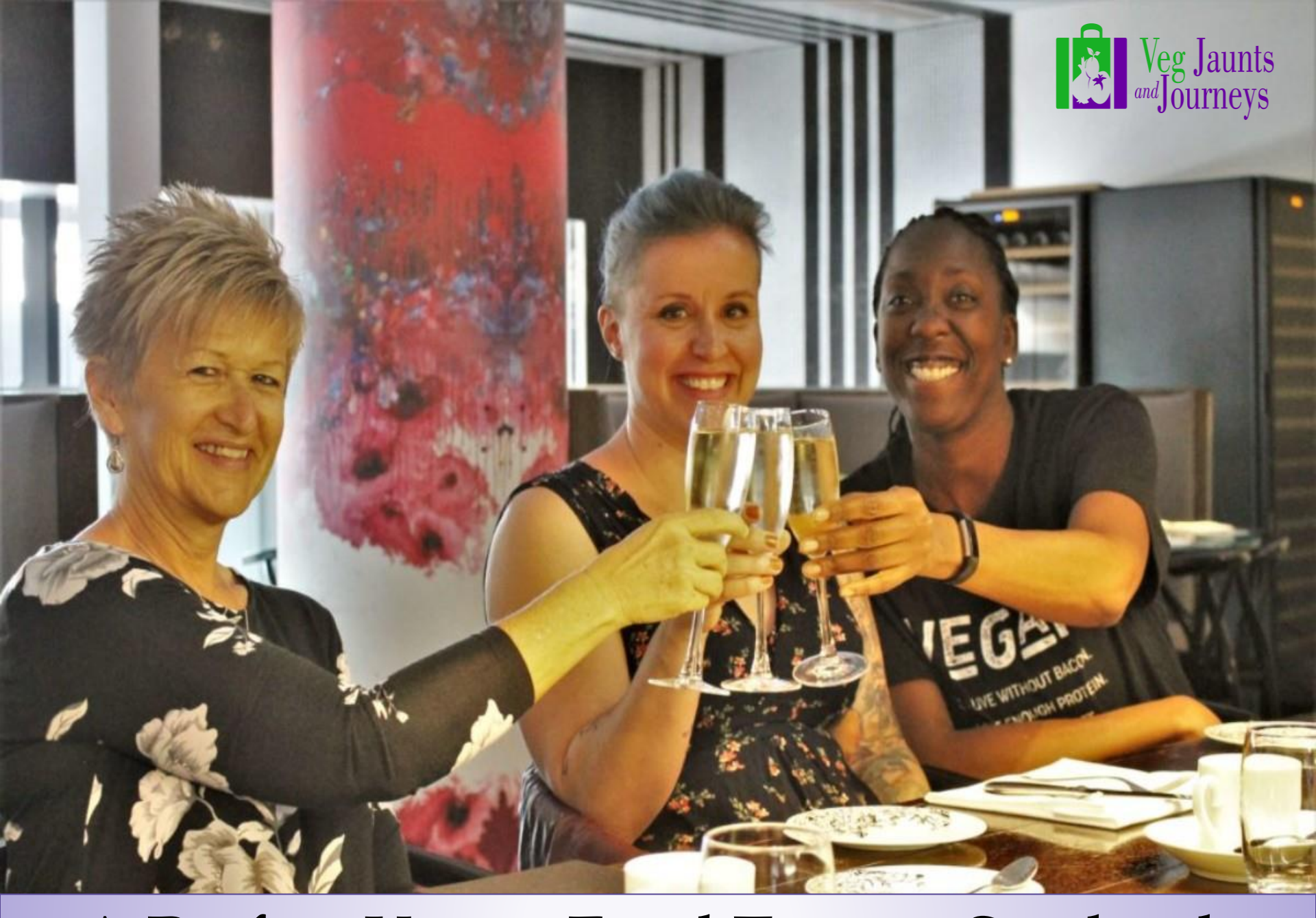
A Perfect Vegan Food Tour to Scotland