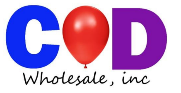
Table Rolls by COD Wholesale